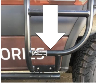
Figure 4: Lower Attachment Assembly